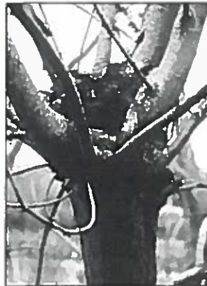
Topping trees results in large areas of decay and fast-growing, weak, and unattractive watersprouts.