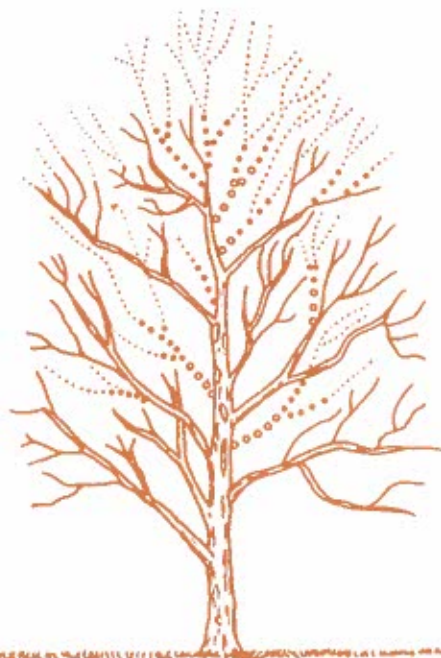
When required because of obstructions, a tree’s height should be reduced using thinning cuts.

Thanks to the and the National Arbor Day Foundation for information and illustrations used in this fact sheet.